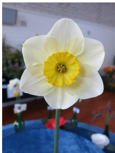
Grand Champion Daffodil 'Citronita'