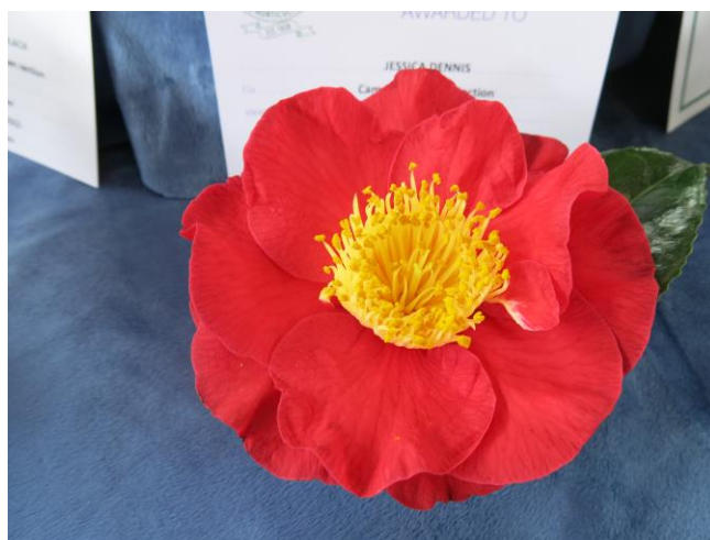
Reserve Champion Camellia 'Red Crystal'