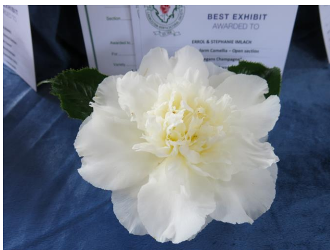
Grand Champion Camellia 'Elegans Champagne'