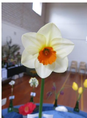
Reserve Champion Daffodil 'Lutana x Lady Diana'