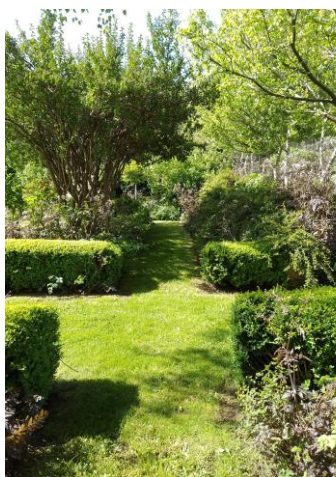
Old Wesley Dale

On 30 October, we were delightfully surprised to wake up to a cloud free day. No rain!!!