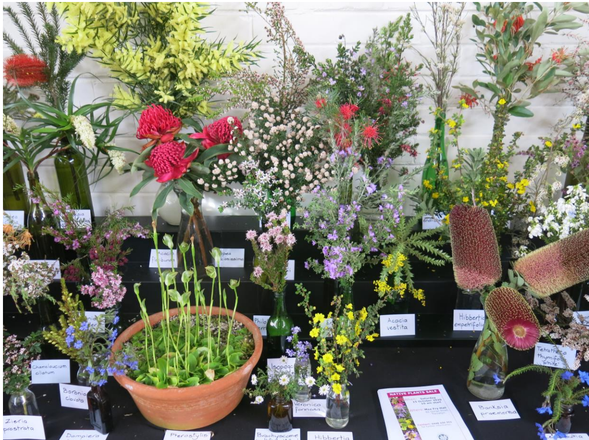
Native Plant Society Display