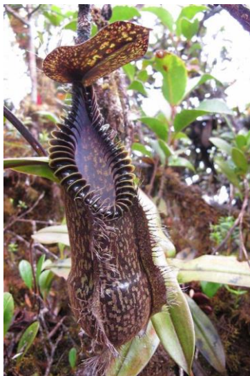
N.hamata , Sulawesi