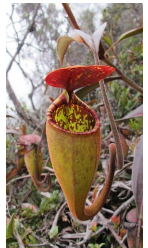
Undescribed Nepenthes , Doormans Top, West Papua