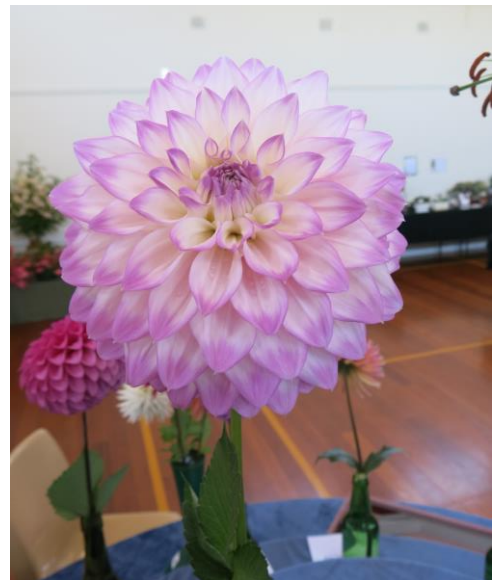
Grand Champion Dahlia