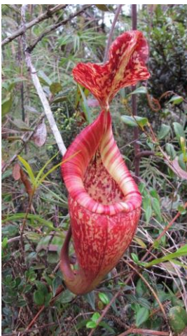
N.maxima , Doormans Top, West Papua