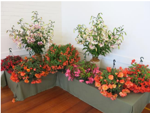
Bob Cherry Display