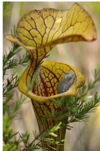
S.flava , Santa Rosa, Texas